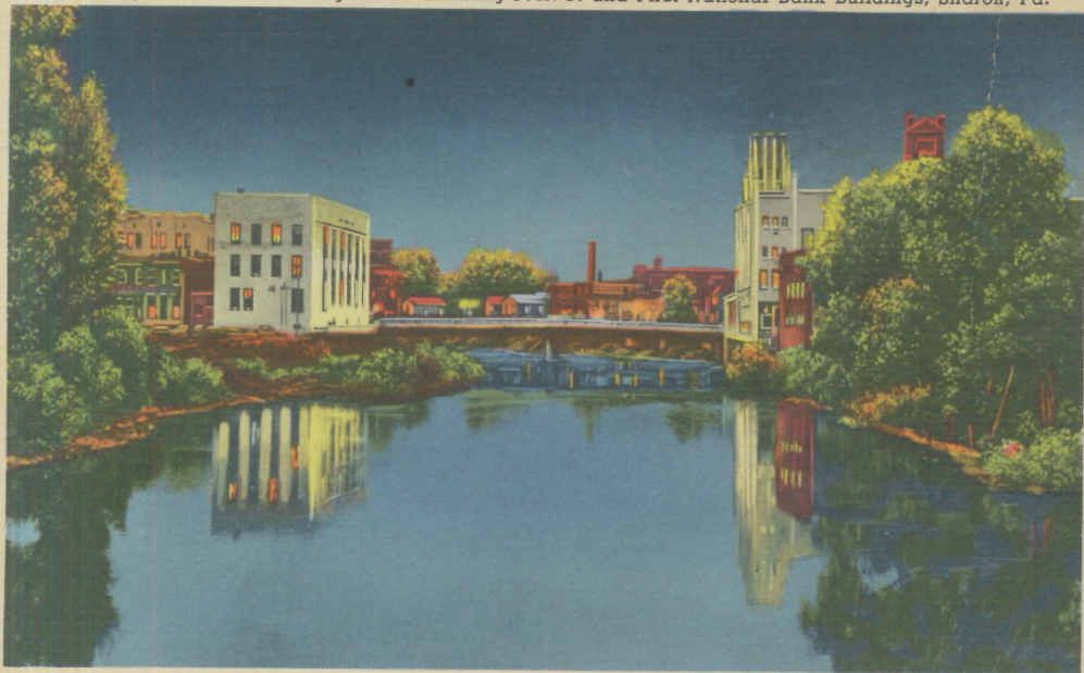
Night Scene on Shenango River Showing P. H. C. and First National Bank Buildings, Sharon, Pa.