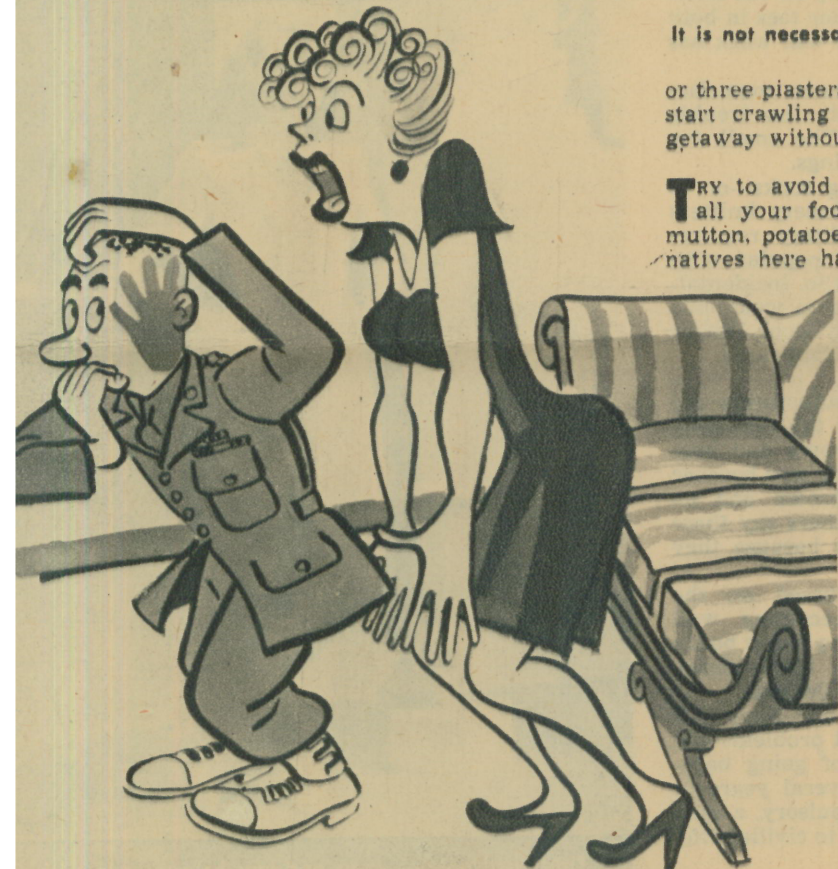
A tribal taboo bans most of the expressive words of soldier sentiment.

D ON'T put on a coat and take a flashlight when you have to go to the latrine. The native huts are equipped with a separate room for this purpose, confusingly camouflaged with white enamel, chromium, brass and booby-trap rugs which slip out from under the unwary intruder.