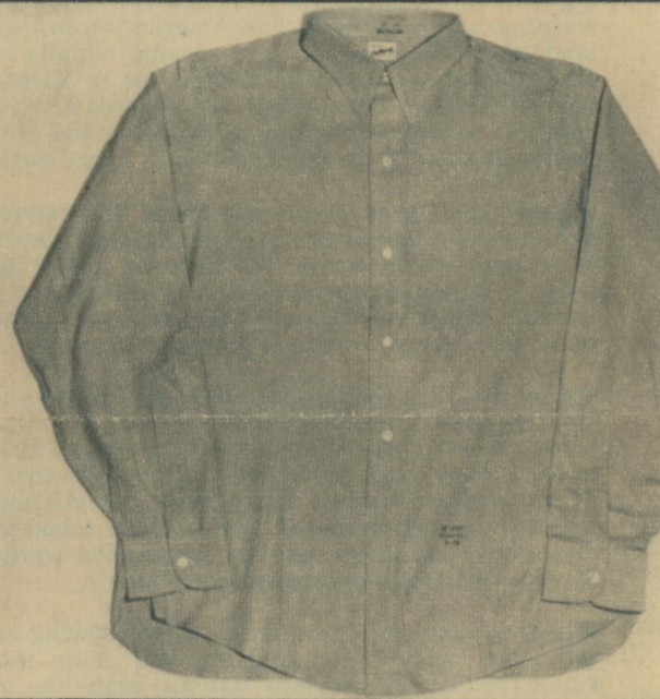
Men's shirt tails are being worn high this season.