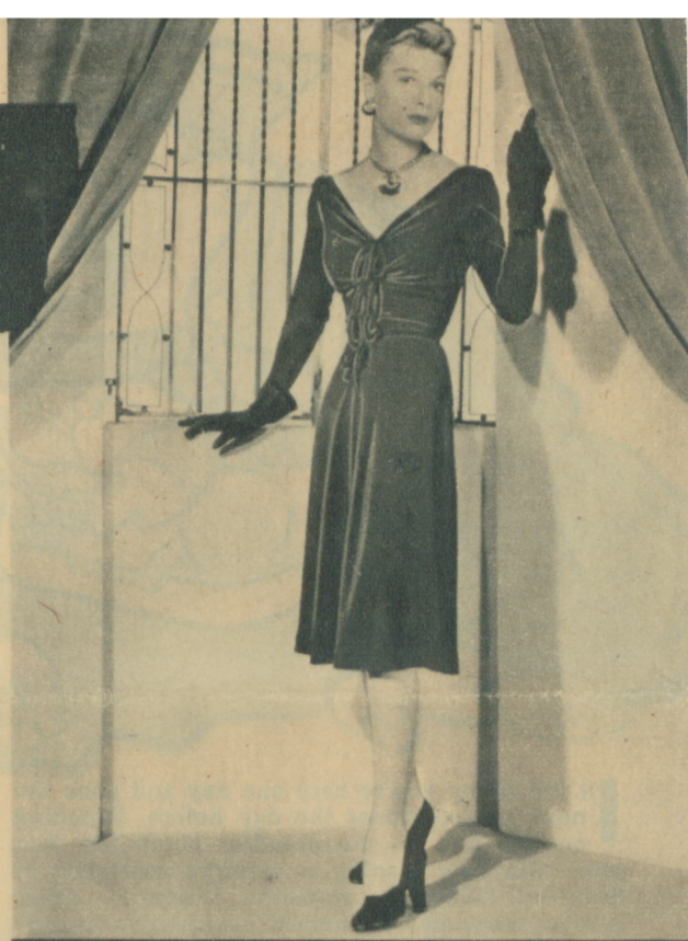
Skirts go up and necklines down for evening wear.

The hat makers hope the Army and Navy will have done away with their biggest problem—the habit young men used to have of going bareheaded. They think that after several years in organizations where hats are compulsory, a man will bring the headgear habit back to civilian life.