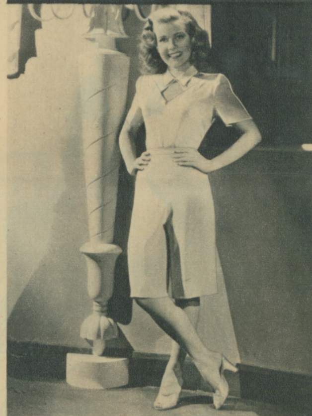
Shortened pajama arms and legs help to save cloth.