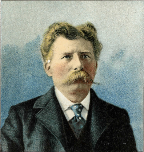
TEUTONIC FAMILY - A GERMAN