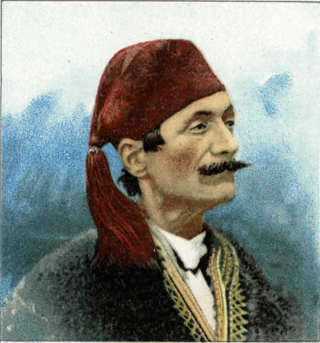
HELLENIC FAMILY - A GREEK