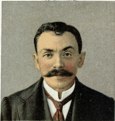
LATIN FAMILY - AN ITALIAN