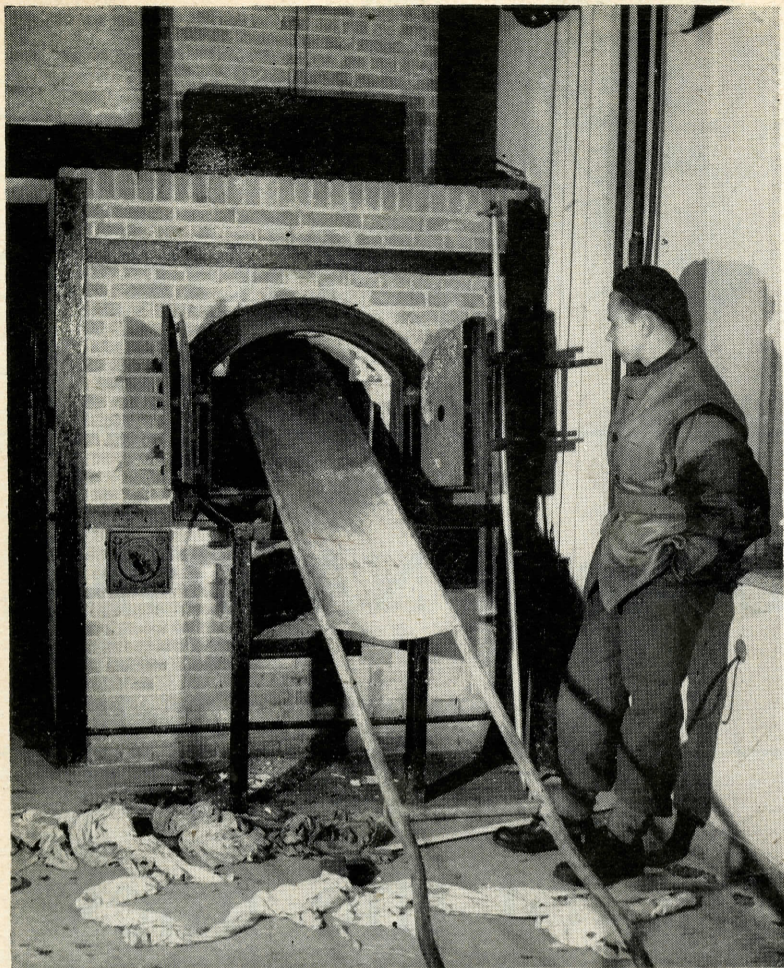
Cremation furnace held one whole body at a time but during busy periods Nazis cut off victims' legs and squeezed in three at a time. The whole prison was solidly built for permanence. Most inmates were members of the underground, Jews or hostages.