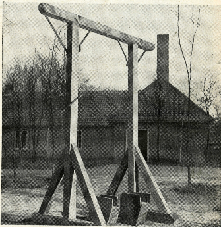
Gallows had very low stools, so that the short drop did not break the neck but only strangled the victim when the stools were kicked from under. Once 58 women were jammed overnight in a 12x7-ft. room at Vught. By morning 11 were dead, 9 insane.