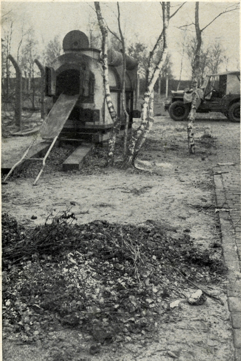
Portable furnace was also used for cremation of the dead. In foreground are visible some of the bones and ashes of the consumed. In the last three days before Allied armies arrived in October, the Nazis burned 580 prisoners in a final blaze of terror.