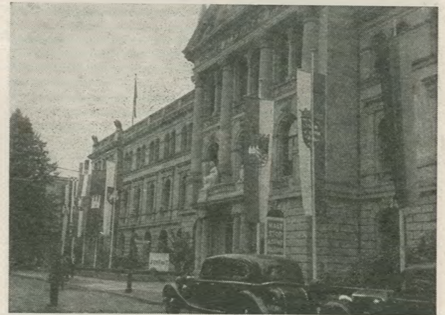
Pedagogical Academy is the site of the discussions of Bonn.

In the Bismarckian Reich the central government could indeed raise revenue