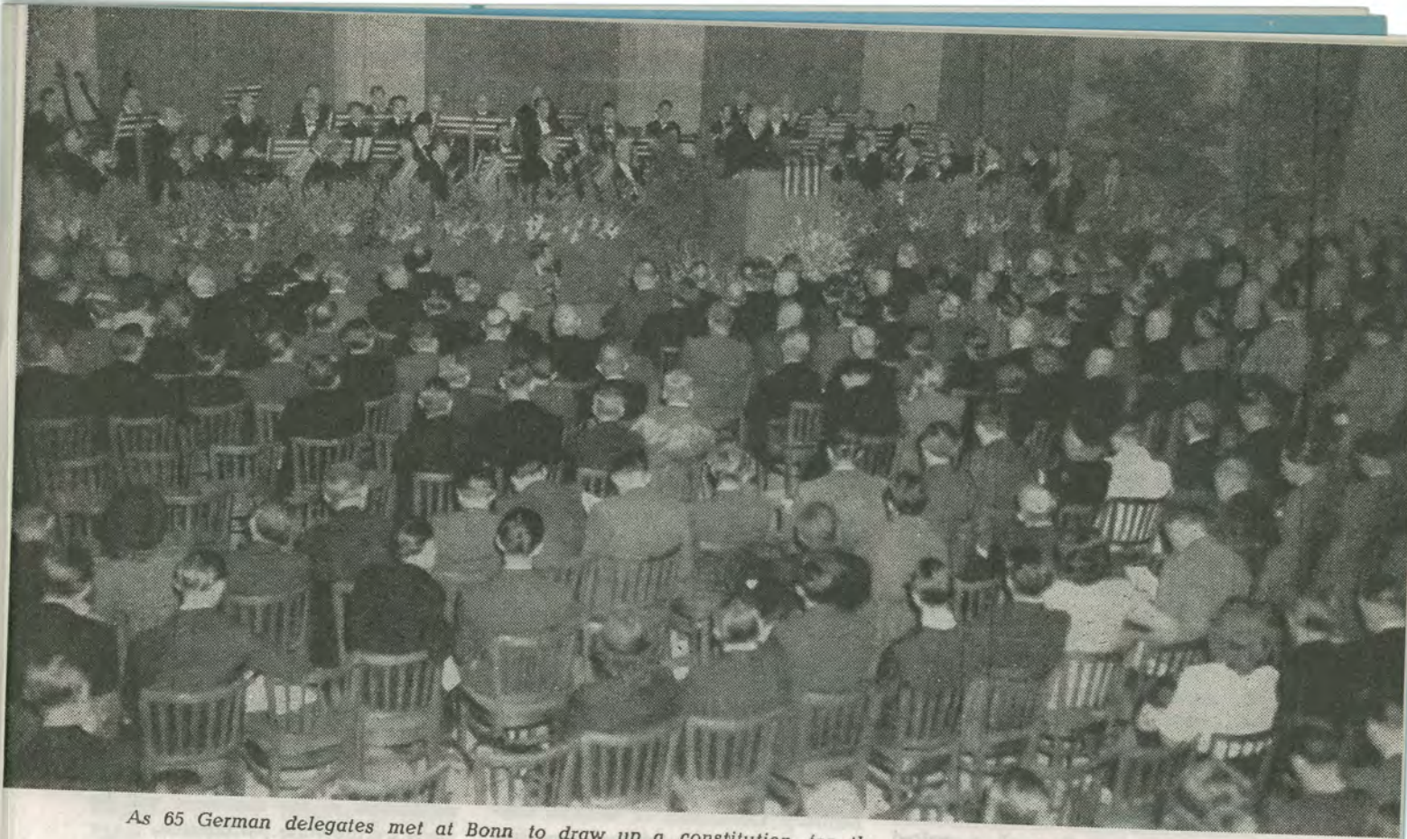
As 65 German delegates met at Bonn to draw up a constitution for the government of western Germany.