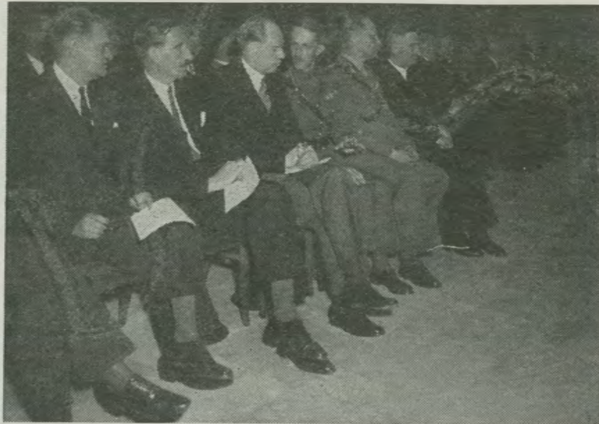
Ambassador Robert D. Murphy (center), special political adviser to the US Military Governor, and other observers at Bonn representing the French and British occupying powers.

This fear of leaving themselves open to the charge of being guilty of "splitting" Germany was the cause of the protracted debate on nomenclature between the three Allied