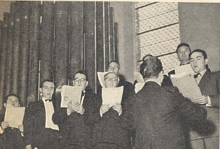
The choir of the Jewish community of Paris made the long journey to Frankfurt to participate in ceremonies.