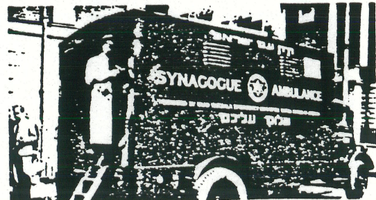
One of the synagogue ambulances that took help into concentration camps.