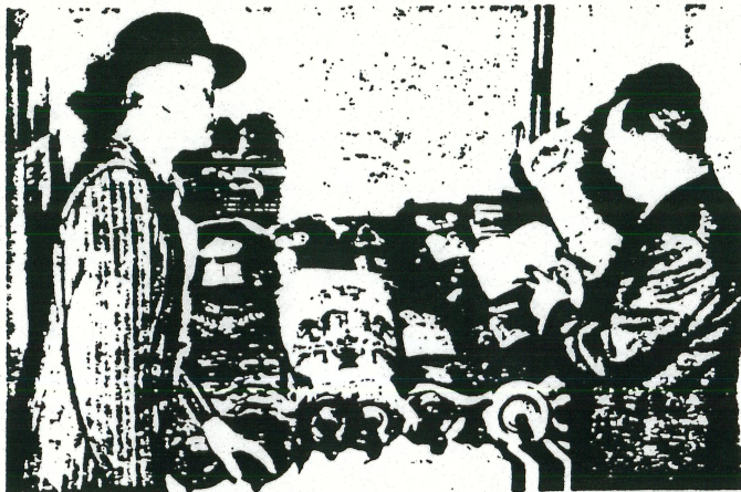
One of many shipments of Sifrei Torah and other religious articles sent to replace those destroyed by the Nazis.