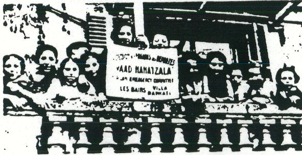
Group of orphans brought from many countries during the war and placed in Vaad Hatzala home in Aix Les Bains, France.

In the Heat of War AN OUTSTANDING RECORD For Today and Tomorrow AN INDISPENSABLE RECORD For the Physical and Spiritual Reclamation of Europe's Jews